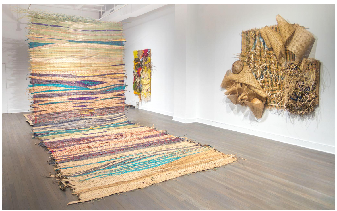
Installation view of Sometimes My Accent Slips Out, 2024.

A solo exhibition by Bhen Alan April 4 – May 18, 2024