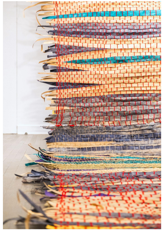
Installation view of Sometimes My Accent Slips Out, 2024