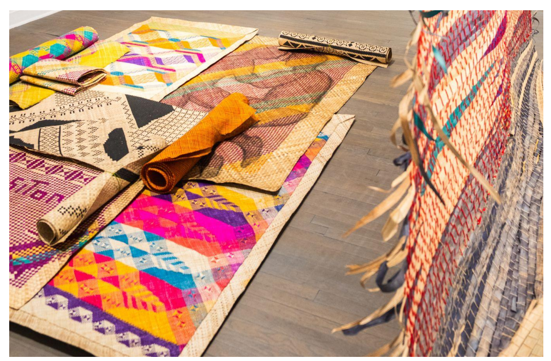
Installation view of Sometimes My Accent Slips Out, 2024