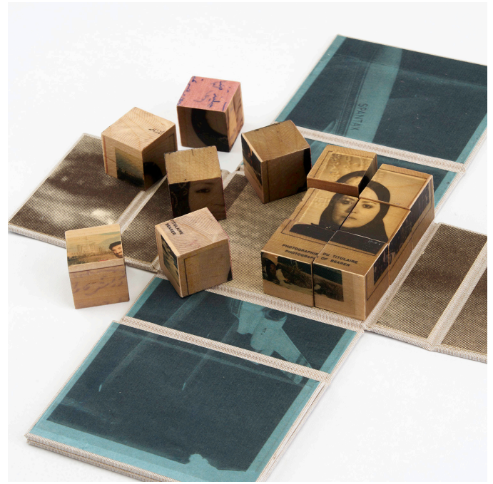
Golnar Adili, She Feels Your Absence Deeply , 2021, 3.25 x 4.25 x 1.75 inches (closed), Publisher: Women's Studio Workshop, Edition of 50.

A striking image of eyes, belonging to the artist's mother, stares back at us from multiple pieces throughout the gallery: printed into gridded fragments on toy wooden blocks, or interwoven with an image of the artist's chest. As Beasley writes in the accompanying exhibition catalogue, "the biographical current within each image, script, or form maintains its autonomy as a lived experience, point of departure, and memory of her own body - all while being opened up, revealed, and transformed. The unfolding of a puzzle is not just a metaphor for the unfolding of a memory, but is in its own right the revealing of a shared language within ourselves. The modularity of form possessed by Adili's objects captivate the imagination and perpetuate a curiosity about who we are, where have we come from, and where are we going."