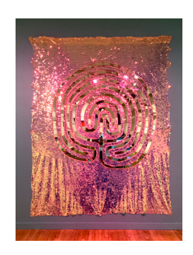
Amaryllis DeJesus Moleski Good Grief (Labyrinth), 2019 Sequin and mirror 122 x 103 inches