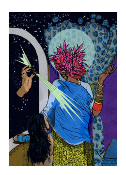
Chitra Ganesh Eclipse, 2020 Archival digital print Edition of 3 63 x 47 inches