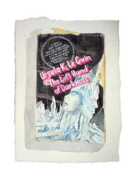
Tuesday Smillie The Left Hand of Darkness, 1980, 2012 Watercolor and acrylic on paper 9 x 6 ½ inches