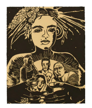
Chitra Ganesh Sultana's Dream: Refugees and Queen, 2018 Linocut, BFK Rives Tan, 280gsm Edition of 35 20 1/8 x 16 1/8 inches Printed and published by Durham Press