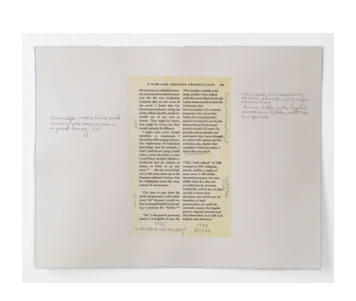
Tuesday Smillie A Slow and Arduous Progression, 2016 Print on paper, polymer plate, and watercolor 11 ¼ x 14 ¼ inches Courtesy of the artist