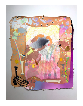
Amaryllis DeJesus Moleski What It Takes (Uroboros), 2021 Gouache, watercolor, color pencil, marker, and acrylic on paper 51 ½ x 44 inches