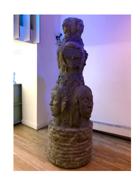
Chitra Ganesh Totem, 2018 Aqua resin, foam, plaster, fiberglass, steel, and cement 86 x 33 inches