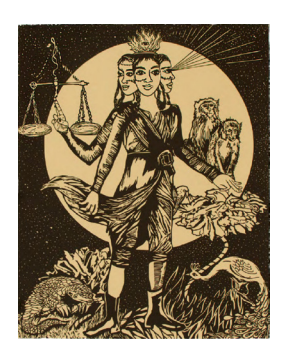
Chitra Ganesh Sultana's Dream: Justice is Virtue, 2018 Linocut, BFK Rives Tan, 280gsm Edition of 35 20 1/8 x 16 1/8 inches Printed and published by Durham Press Courtesy of Durham Press