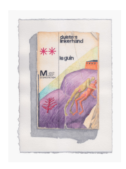
Tuesday Smillie Duisters Linkerhand, 1971, 2016 Watercolor and ink on paper 9 5/8 x 6 ¾ inches