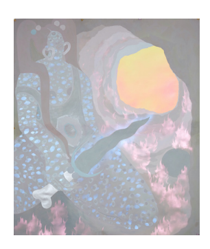
Amaryllis DeJesus Moleski Alarm Clock, 2019 Gouache, watercolor, acrylic, and airbrush on paper 91 x 78 inches