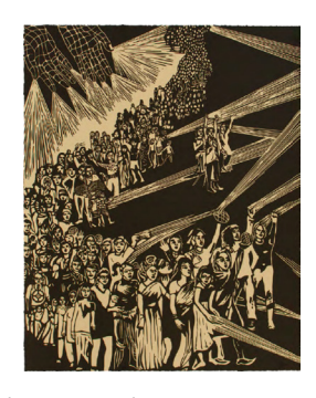
Chitra Ganesh Sultana's Dream: Art of War 1, 2018 Linocut, BFK Rives Tan, 280gsm Edition of 35 20 1/8 x 16 1/8 inches Printed and published by Durham Press Courtesy of Durham Press