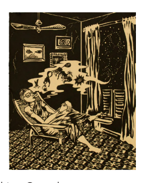
Chitra Ganesh Sultana's Dream: The Condition of Womanhood, 2018 Linocut, BFK Rives Tan, 280gsm Edition of 35 20 1/8 x 16 1/8 inches Printed and published by Durham Press