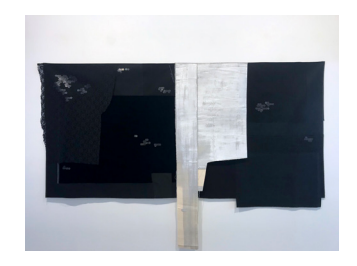
Tuesday Smillie Reflecting Light, 2018 Textile, oil paint, sequins, and embroidery floss 66 x 100 ¾ inches