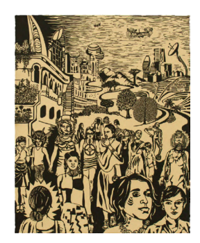
Chitra Ganesh Sultana's Dream: City in Broad Daylight, 2018 Linocut, BFK Rives Tan, 280gsm Edition of 35 20 1/8 x 16 1/8 inches Printed and published by Durham Press Courtesy of Durham Press