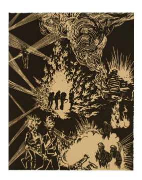
Chitra Ganesh Sultana's Dream: Art of War 2, 2018 Linocut, BFK Rives Tan, 280gsm Edition of 35 20 1/8 x 16 1/8 inches Printed and published by Durham Press