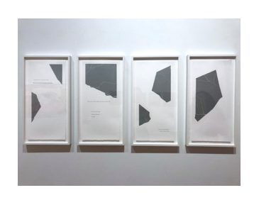
Tuesday Smillie Where our foot will land, 2016 Print on paper, plexiglass plate, and lead type 22 ½ x 10 ½ inches each